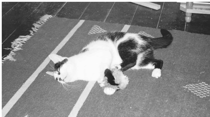
Freyja beating up a toy mouse

They met each other a few days later and Cobweb became quite jealous and territorial around me. At this point Perky was still keeping her distance from me, but she claimed her territory by sleeping in some of Cobweb's favourite spots and this led to us getting closer.